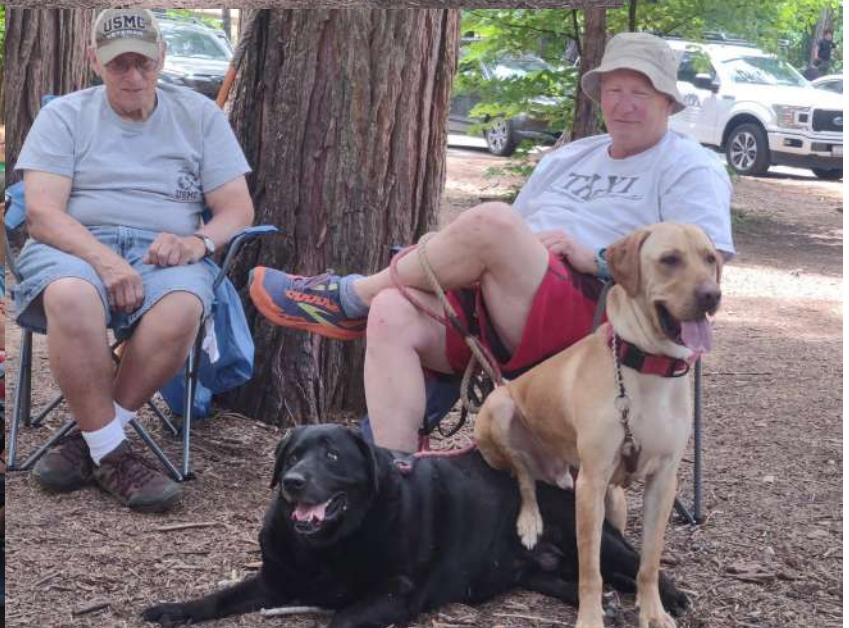
Best Seat in Camp!