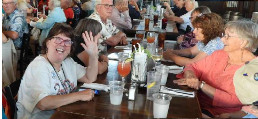
Saturday Night Group Dinner