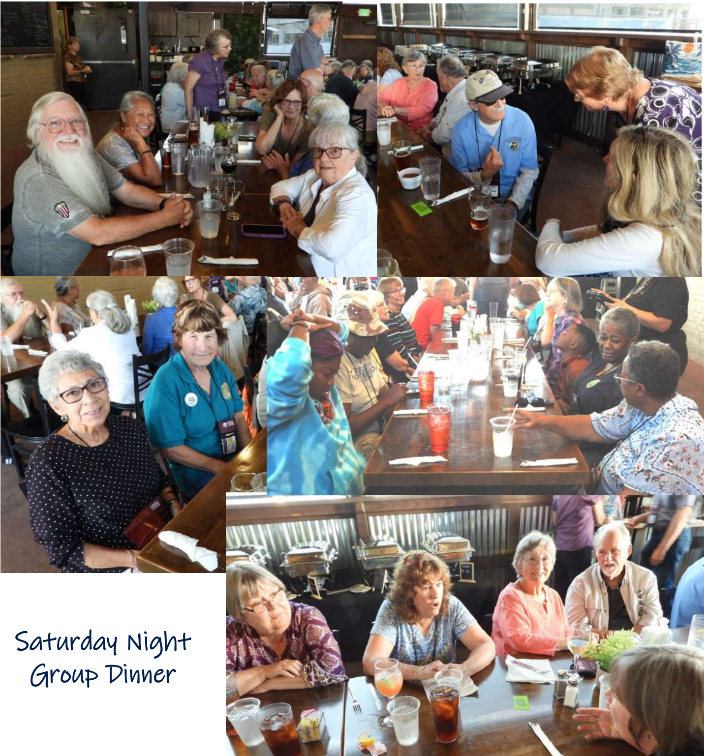
Saturday Night Group Dinner