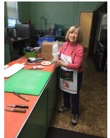
Pioneer Congregational Church January 1, 2018