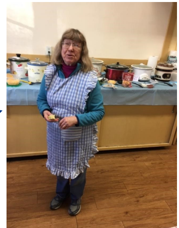
Pioneer Congregational Church January 1, 2020